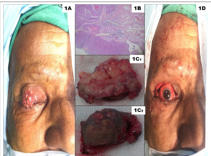
Figure 1: 1A-Patient profile showing tumor arising from the upper eyelid; 1B-Biopsy showing high grade sebaceous gland carcinoma; 1C1 and 1C2-Resected specimen showing the tumor; 1D-Defect in the eyelid after the resection of the tumor of the upper eyelid.