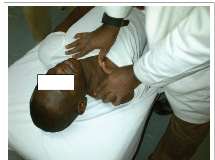
Figure 1: Positioning for sternoclavicular inferioanterior glide

Corner stretching exercise: This exercise was carried out to stretch tight pectoral muscles and fascia. The patient stood and faces the corner of the treatment room with each palm on the walls of the room that form the corner. He was then instructed to leans his body toward the corner without moving his hands or forearms on the wall and then reverses the movement. 3 sets of 10 repetitions of this exercise was carried out in a session.