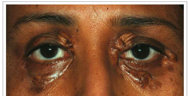
Figure 1: Persistent multiple yellowish skin lesions involving all 4 eye lids

aided by removal of the underlying periosteum. The histopathological examination of the excised orbital tissue showed sheets of foamy histiocytes with few aggregates of lymphocytes (Figures 2B and 2C) some of which are forming germinal centers. Giant cells including Touton giant cells were seen (Figure 2D). Significant fibrosis was evident but there was no evidence of necrobiosis in any of the sections (Figure 2E). The xanthoma cells showed positive staining with CD68 while they were negative to S-100 and CD1a (Figure 2F). The final diagnosis of xanthogranuloma was made. She was further evaluated medically to rule out asthma and/or systemic associations. The areas of her skin incisions were managed by direct closure with no need for skin graft or reconstruction. The patient had good postoperative cosmetic appearance with no eyelid margin mal-positioning or lagophthalmos. She was referred from a general hospital where her systemic work up was reported to be negative.