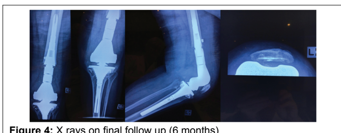
Figure 4: X rays on final follow up (6 months)

The suction drain and pain buster were removed after 48 hours without removing the dressing over the surgical wound. Patient was placed under supervised physiotherapy regimen for knee bending and muscle strengthening exercises. Partial weight bearing with extension knee splint and crutches was allowed from the first post operative day. Full weight bearing without knee splint was started after 2 weeks. At the last follow up (6 months) patient was walking unassisted with full weight bearing and the knee range of motion was 0 to 110 degrees. Wound has healed well without complications. But the patients have post traumatic arthritis of ipsilateral hip for which the surgery will be planned subsequently.