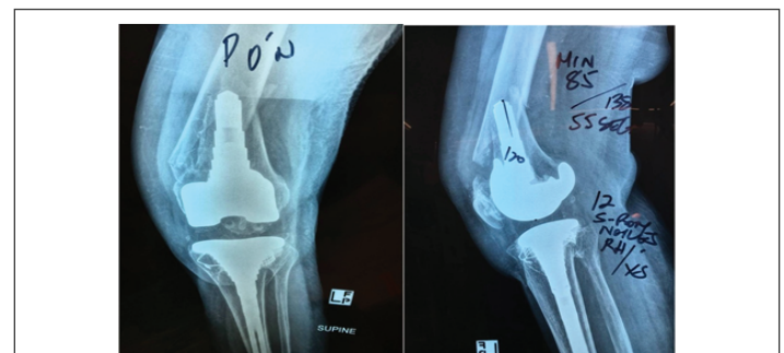
Figure 1: Peri prosthetic distal femur fracture (Lewis and Roraback type-II)

90 years active female presented to us with trivial fall from standing height with severe pain and swelling over left knee. She is in excellent health and very active with previous history of deep vein thrombosis (DVT). Radiograph showed Type II Lewis and Rorabeck supracondylar distal femur fracture (Figure 1). Patient had well fixed S-ROM stemmed knee implant with metaphyseal sleeves in situ which was implanted 27 years back after a complex revision total knee arthroplasty. But given the nature of the fracture and its extension around the femoral component,