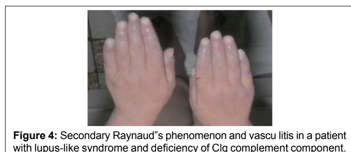
Figure 4: Secondary Raynaud's phenomenon and vasculitis in a patient with lupus-like syndrome and deficiency of C1q complement component.