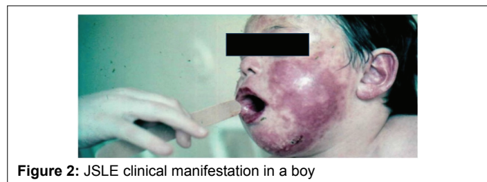
Figure 2: JSLE clinical manifestation in a boy