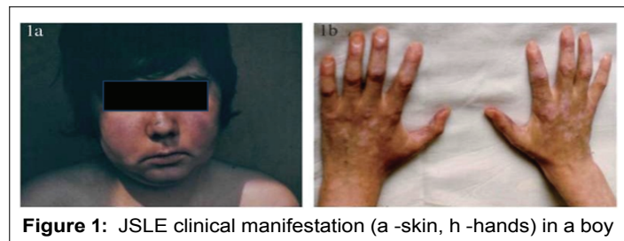
Figure 1: JSLE clinical manifestation (a -skin, h -hands) in a boy

* lupus-like syndrome in boys with deficiency of C1q complement component, GLN-glomerulonephritis Le-penia: Leukopenia; LE erythema: Lupus erythematosus