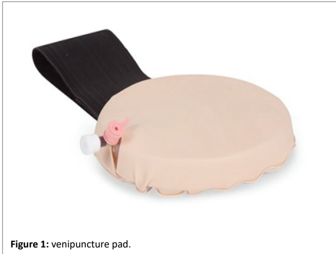
Figure 1: venipuncture pad.