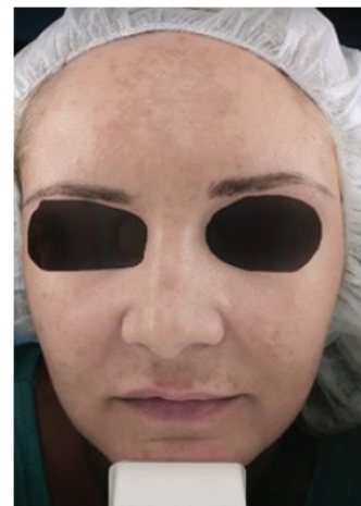
Figure 1: Image showing centrofacial pattern of melasma involvement

Histopathology of melasma lesion shows an increased melanin deposition in all layers of epidermis, with elastosis and mast cells more pronounced than in normal skin [12]. The most affected biological process is lipid metabolism [8] there is down regulation of various lipid metabolism genes caused by chronic UV exposure.