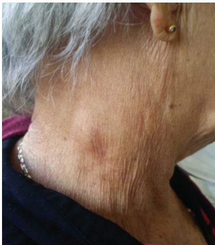
Figure 1: Cervical ganglion.

anorexia, profuse nocturnal sweating, weight loss, generalized lymphadenopathy, splenomegaly and respiratory episodes of an infectious nature, for which antibiotic treatment has been needed? The most prominent feature in the physical examination was the presence of multiple cervical, axillary and bilateral inguinal adenopathies (Figure 1) in blood cytometry at admission, anemia (Hb 6.6 g/dL) was noted Peripheral Lamina: Hypochromia XXX, Roleaux Phenomenon, red blood cells in target. Anisopoikilocytosis, normal platelets in number and aggregation, slightly increased leukocytes. Blood chemistry without alterations, protein electrophoresis without alterations, coagulogram and normal fibrinogen. Abdominal US showed Liver with changes in the ecotexture at the level of the costal margin, thin-walled vesicle without lithiasis, both kidneys with good medullary cortical relation without lithiasis or dilatation, moderate splenomegaly, normal pancreas, no free liquid in cavity. Medullogram where the myelodysplastic process reported. Treatment started with Hydroxyurea and support with erythropoietin. Faced with an unfavorable evolution, it I decided to send Hermanos Ameijeiras Hospital where she admitted to carry out further studies.