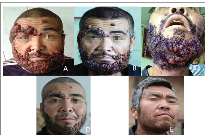
Figure 1: Facial photos of the patient during treatment and follow-up.

Although not crucial to establishing the diagnosis, follow-up should include the judgment of potential pathogens [8]. We are unaware of any previous reports of a systemic multiple strawberry-like infectious granuloma. Although for our patient initially, without culture results, it would have been imprudent to ignore the possibility of a refractory infection. Following the negative culture result, we were prompted to question whether the lesion was associated with work environment.