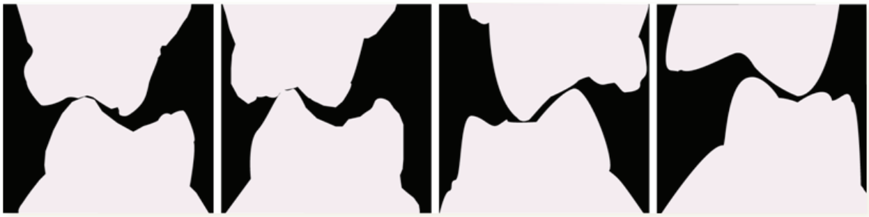
Figure 3: Unworn molars in occlusion.

is an understanding of various body parts and their functions. Aristotle was the first to describe how form and function govern anatomical studies. The masticatory system is characterized by three main components (the TMJ, the muscles of mastication, and the design of the dentition) that interact to form a coherent whole. It should be the mandate of every restorative dentist to understand and maintain the harmonious relationship of these three components to promote the oral health of the system.