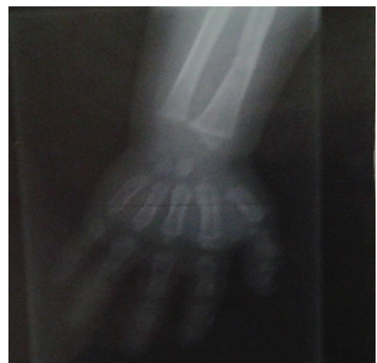
Figure 3: Photograph showed osseous maturation, advanced for her chronological age.