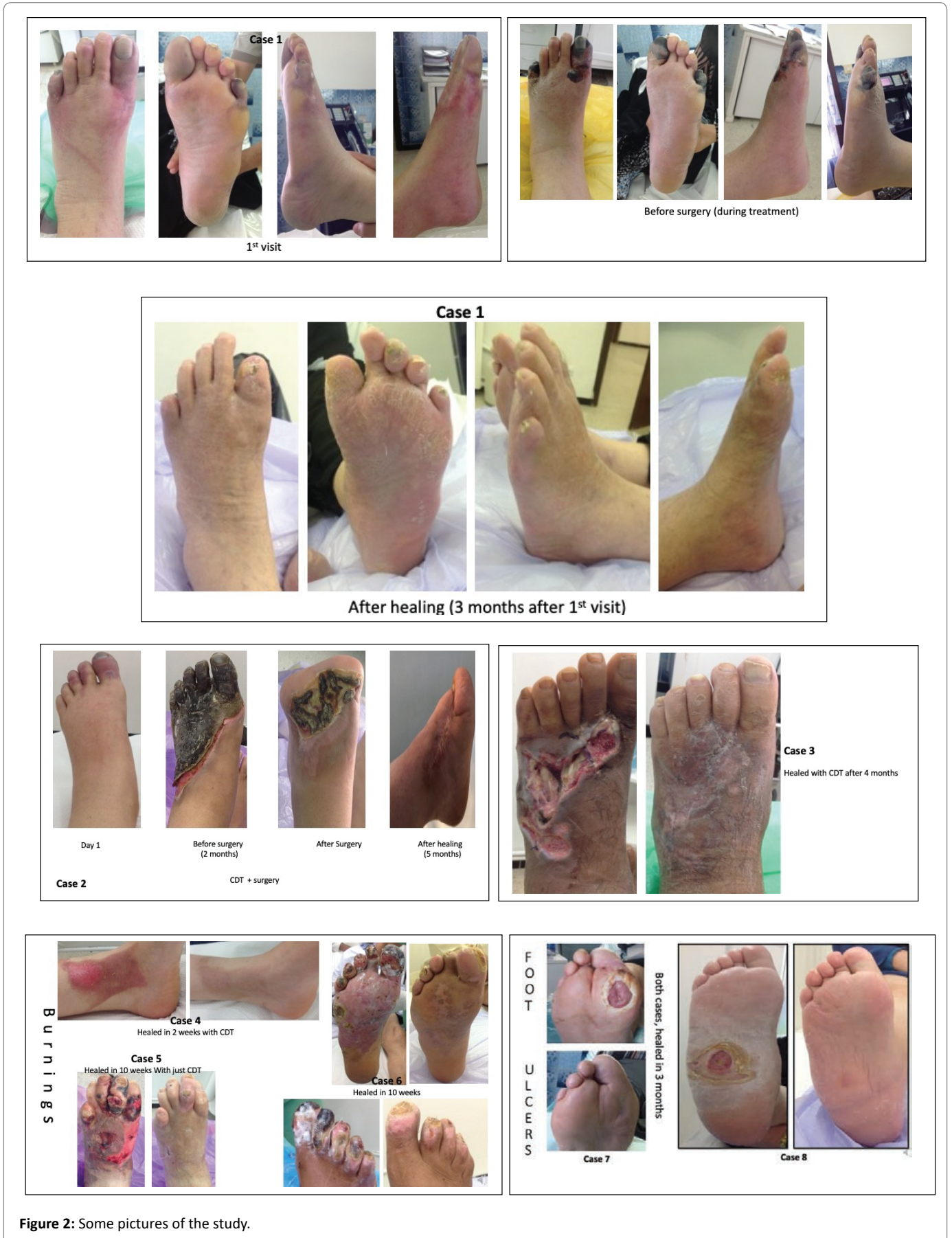
Figure 2: Some pictures of the study.