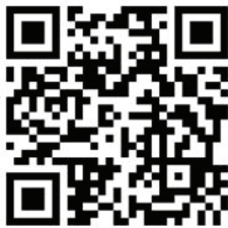
Figure 2: QR code of "Epiketon".