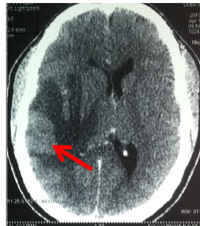
Figure 2: CT scan with injection of contrast product. We can notice a catch of contrast by the lesion which is better visible and is encircled at any time by the oedema in shape of thimble.