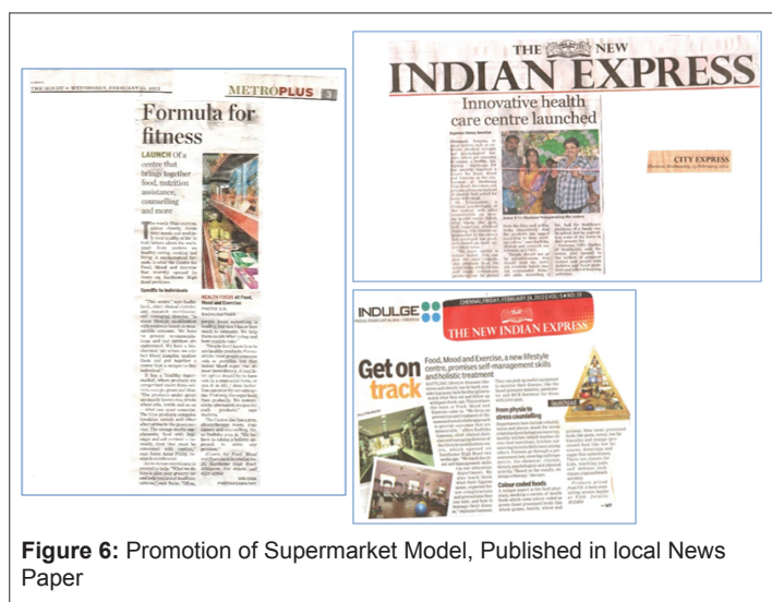
Figure 6: Promotion of Supermarket Model, Published in local News Paper