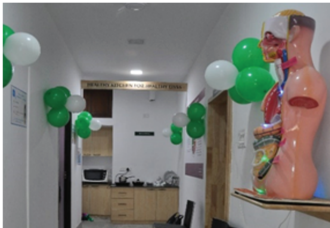
Figure 2: Health Kitchen for Live demonstration