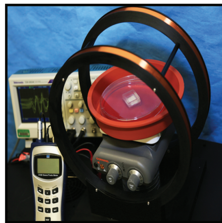
Figure 1: PEMF Generating Device.

PEMF Treatment: Cell-seeded scaffolds, in frames, were taken directly from incubators in plates including media, and were placed in 34°C [osteoblasts] or 37°C [MSCs] water bath, and exposed to a 15 Hz, 2.4 mT uniform PEMF generated by a Helmholtz coil (Figure 1), for 20 min, 3x/week for 3 weeks. This time point was chosen because of its previously