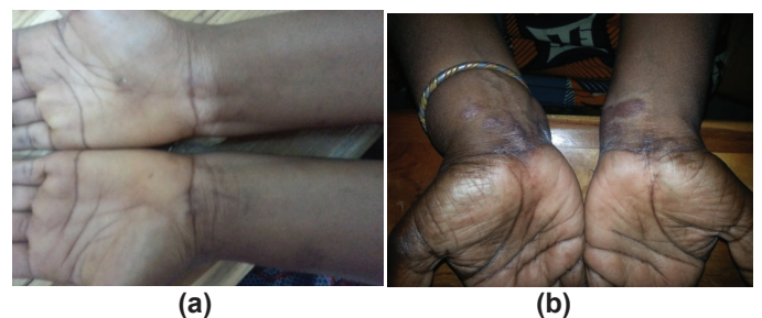
Figure 4: (a and b) Favorable operating scars on two patients one month of recoil before.

All parameters related to the intervention, including intraoperative incidents and immediate, sides and late postoperative complications were noted and studied.