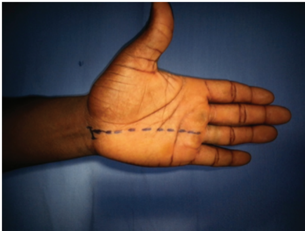
Figure 1: Line of the palmar incision and direction of the opening of Flexors Retinaculum (into dotted)