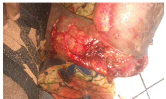
Figure 1: Important loss of substance from inside face of the elbow with telluric debris. Photo made at the arrival of the victim.

A daily dressing was achieved during three days under general anesthesia in the surgery room. During these dressings a cleaning was performed with excision and debridement of necrotic tissues. Four days later, the wound became clean (Figure 4) and the victim was readmitted