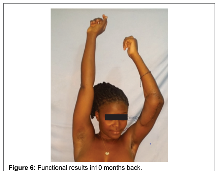
Figure 6: Functional results in10 months back.