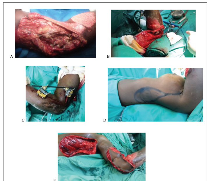
Figure 5: Definite surgical treatment

The immediate postoperative period was uneventful without occurrence of complications. At 10 months follow-up, there was complete healing of the flap. In terms of mobility, the elbow was blocked in functioning position. The active flexion was 10 degrees. The active extension 0 degrees (Figure 6).