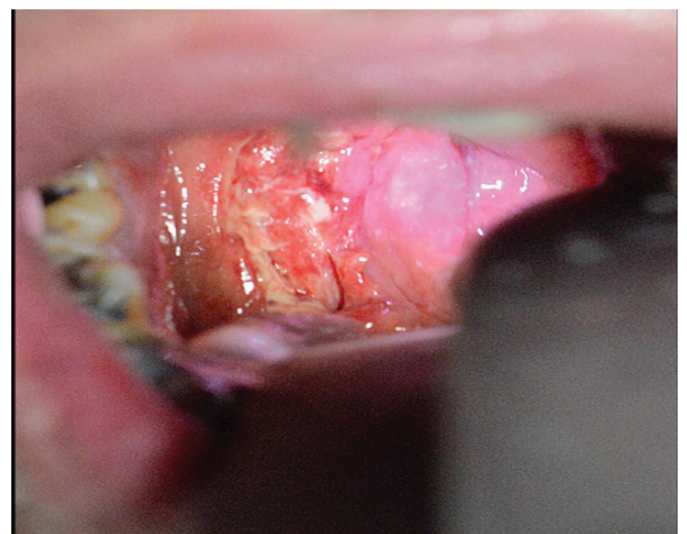
Figure 2: Area of loss of mucosal integrity in the region of the Right faucial pillar suggestive of site of trauma during oropharyngeal instrumentation.

Histological analysis of right vocal cord biopsies taken during microlaryngoscopy confirmed a moderately to well differentiated invasive squamous cell carcinoma. Following discussion at the head and neck oncology multidisciplinary team meeting, a decision was made to treat his laryngeal malignancy (T2 N0 M0) with radiotherapy. The patient was decannulated, and 6 weeks after initial presentation and following a prolonged period of treatment and rehabilitation he was discharged home with a plan to commence his radiotherapy when fully recovered (Figure 3).