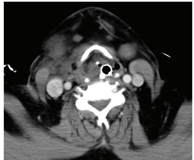
Figure 3: Interval axial CT scan image of the neck one week after initial presentation with an overall significantly improved appearance. Endotracheal and nasogastric tubes are seen in situ .