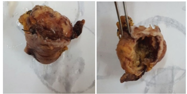
Figure 2: Completely resected endometriosis mass.

fibrosis, with scattered foci of stromal tubular and cystic glandular endometrial tissues within connective tissue. So she referred to her gynecologist for further management and hormonal therapy. After one-year follow up, there was no recurrence of endometriosis.