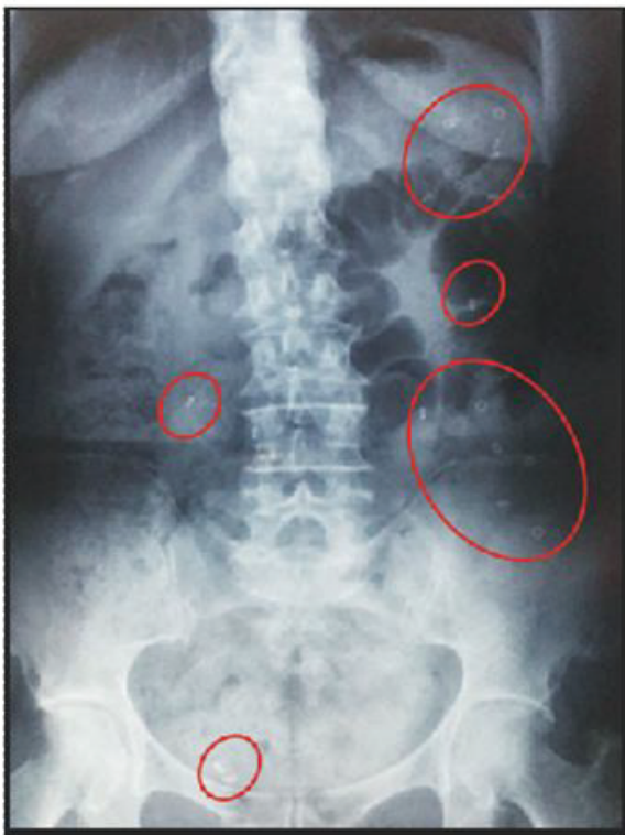
Figure 1: Colonic transit time. Abdominal radiograph after ingestion of 24 radiopaque markers after the 5 th day, the patient still had 20 markers.

the transverse colon was approached at the final step of the dissection. All vascular pedicles were handled near to the colon. The left colonic segment section was held in colorectal transition with two purple loads laparoscopic 45 mm stapler. Colonic right section was held 10 cm from the ileocecal valve into the ileum. Surgical specimen was externalized through the enlargement of umbilical 10 mm trocar. Ileorectal anastomosis was performed with circular 31 mm with a thickness of 4.8 mm stapler transanal introduced. Total operative time was 106 minutes. The first 24 hours postoperative period was conducted in an intensive care unit. The oral test diet was started on the first day after surgery. Patient developed gastro paresis 48 hours after the start of oral test diet, the situation was reversed with pharmacological treatment and zero oral diet. Patient was discharged on the ninth postoperative day in a good general condition without other complications. The pathological examination showed no microscopic lesions on surgical specimen. The patients currently in ambulatory follow up after one year of surgery, keeping one to two evacuations daily with normal consistency, without abdominal pain, diarrhea or use of medications for constipation. The new Wexner score of constipation was zero.