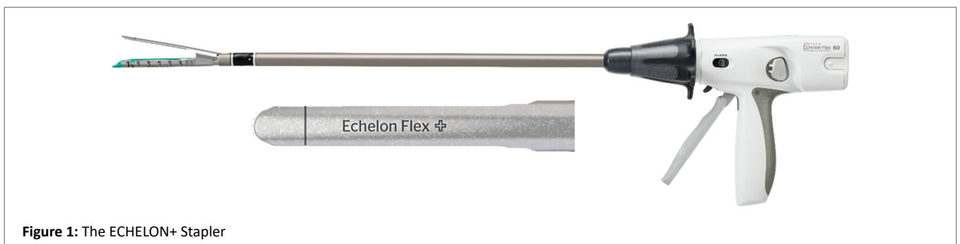
Figure 1: The ECHELON+ Stapler

For analysis of staple line leak pressures, two-sample t-tests were used for comparison of means. One-way ANOVA was employed to assess mean thicknesses of ileum tissue used for each device group. The number and frequency of specimens in which leaks occurred at or below defined pressures and the number of malformed staples were compared for device groups using two-sample tests of proportions. For comparison of compression medians, the Mann-Whitney test was used. An alpha level of significance was taken as 0.05 in all comparative analyses.